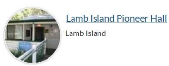
Lamb Island Pioneer Hall Lamb Island