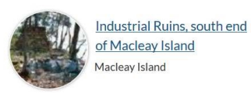
Industrial Ruins, south end of Macleay Island Macleay Island