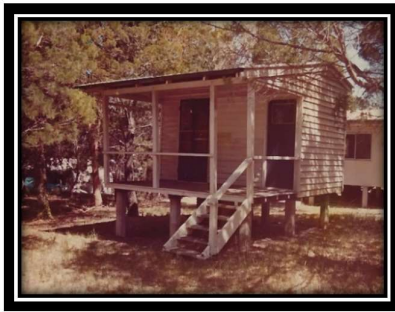
Photo 1: Dwelling at Pullen Street purportedly the Beenleigh Lock-Up (1987)

The property had no toilet, no plumbing of any kind, no power and no water, but these issues couldn't dampen the couple's dream to purchase their island getaway.