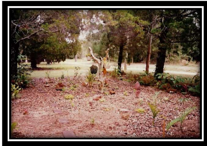
Photo 4: Early stages of Ada's garden after purchasing the block next door

Small communities often see greater community engagement in local events and activities as many Coochie-ites will attest, so it's no surprise that apart from gardening, fishing and crabbing the Mears' threw themselves into a hectic social life by joining the Redland Bay Square Dancing Club, the Donald Simpson Centre for Cleveland's Over 50s, the Coochie Garden Club and much more.